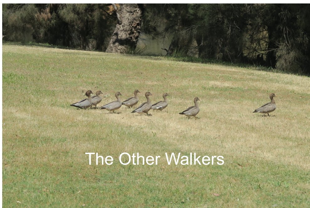
The Other Walkers