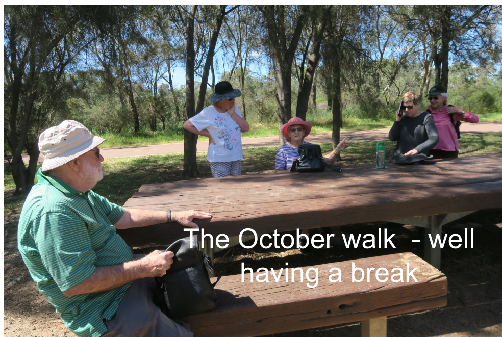
The October walk - well having a break